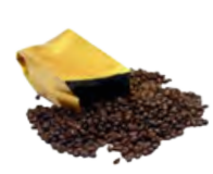
Foil Coffee Bags