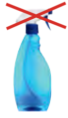
Cleaners (discard nozzles)