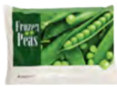
Frozen Food Bags