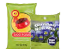
Pet Food & Landscape Bags