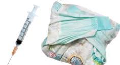
Medical & Hygiene