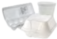
Styrofoam for Food

These items are NOT RECYCLABLE. Dispose of them in your trash: