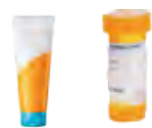
Tubes & Pill Containers