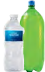
Water & Pop